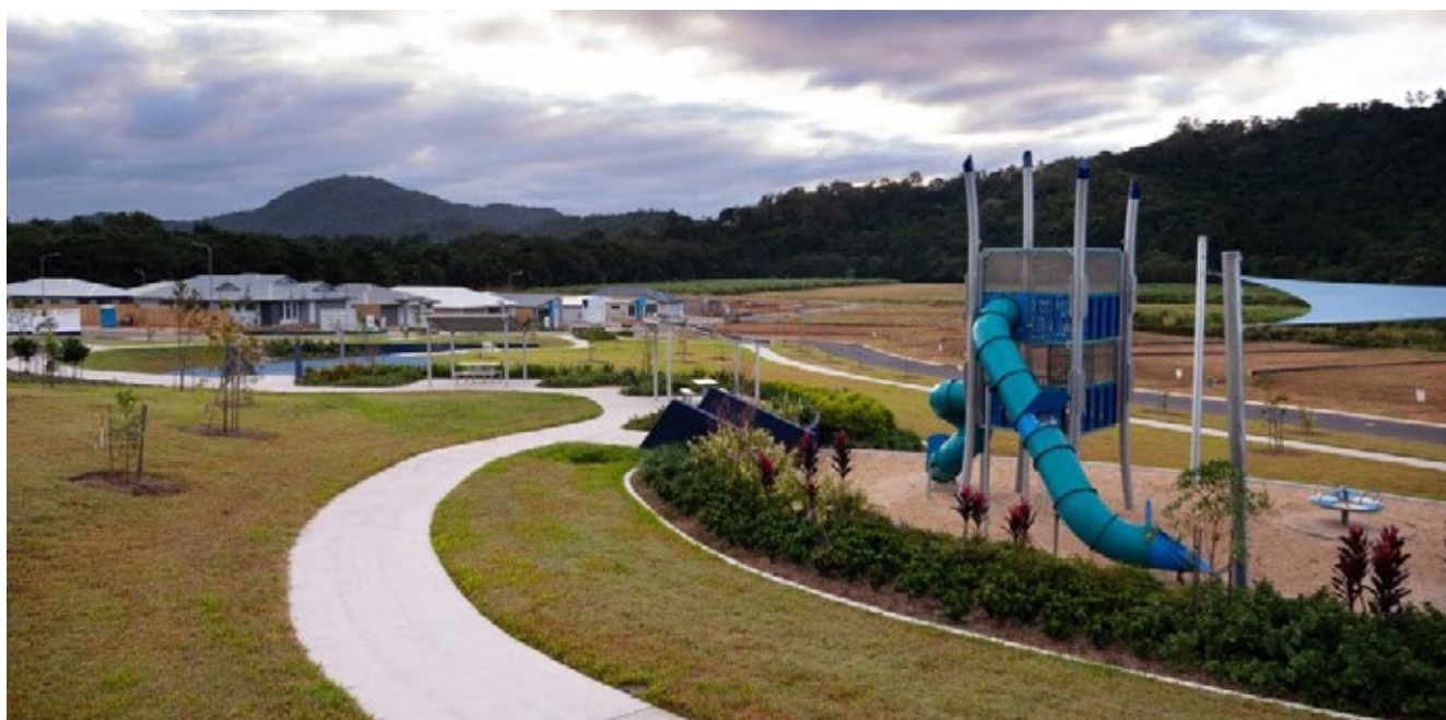
Redlynch Vistas, Redlynch, Queensland, Australia - Designed by LA3