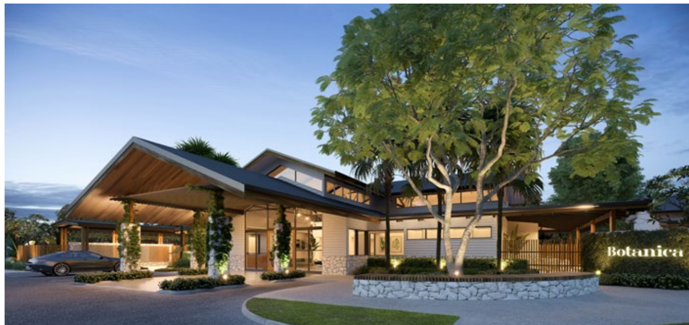
Urban Design at the newly built Botanica Lifestyle Resort, Smithfield, Queensland